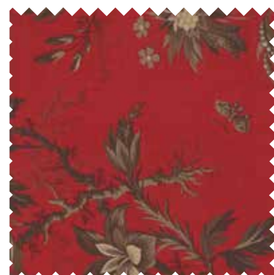
No 13652 14* Rouge