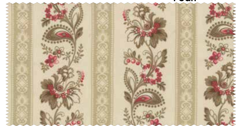
No 13651 16* Pearl

Floral stripe repeats 8 times measuring approx 3 3/4" wide