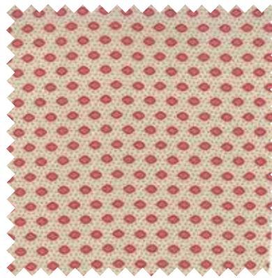
No 13655 17 Pearl