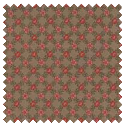
No 13658 16 Antique Tan