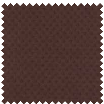
No 13659 34* Old Brown