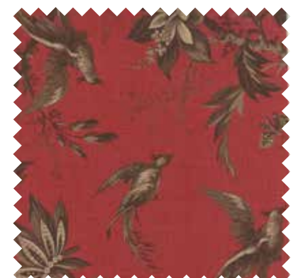
No 13652 12 Warm Red