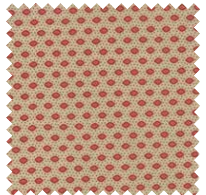
No 13655 18 Oyster