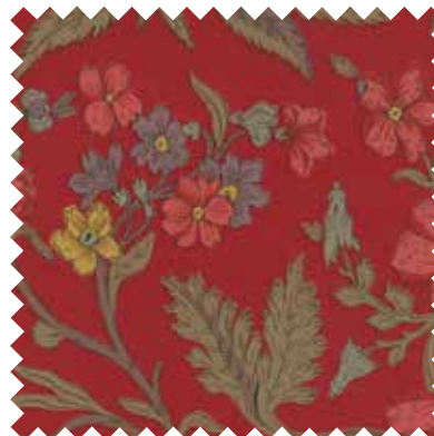
No 13650 12 Rouge