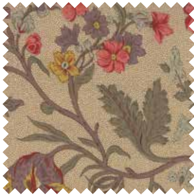
No 13650 15 Oyster