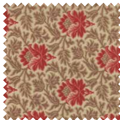
No 13653 17* Oyster