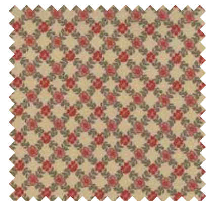
No 13658 15 Oyster