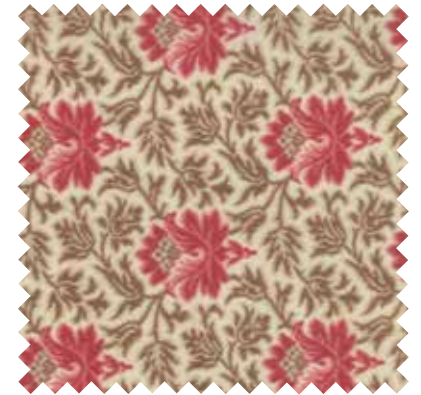
No 13653 16 Pearl