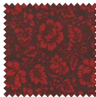
No 13654 17* Old Brown