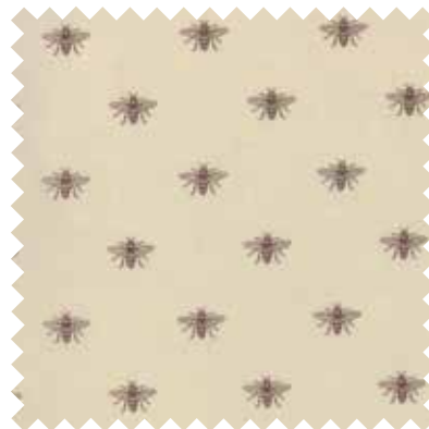
No 13656 14* Oyster