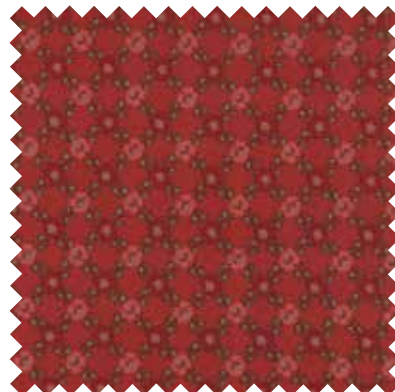
No 13658 12 Rouge