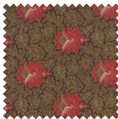
No 13653 15* Old Brown