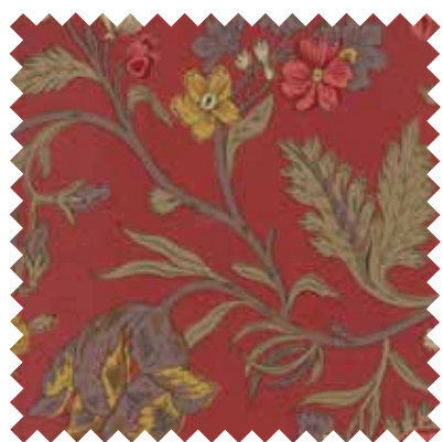
No 13650 11* Warm Red