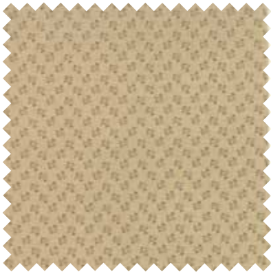
No 13659 39 Oyster