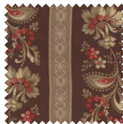
No 13651 15* Old Brown