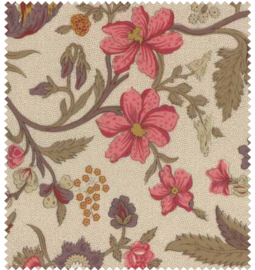
No 13650 14* Pearl