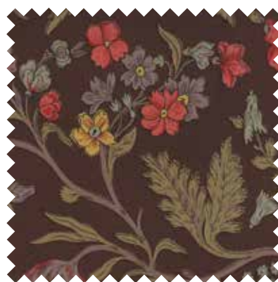
No 13650 13* Old Brown