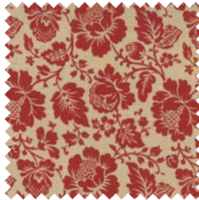
No 13654 23 Oyster Rouge