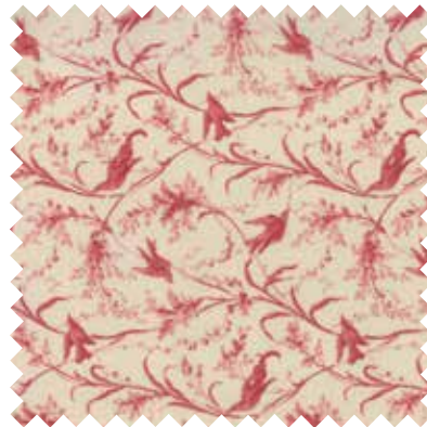
No 13657 17* Pearl