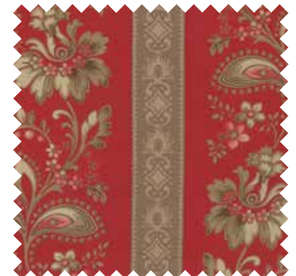
No 13651 13* Rouge