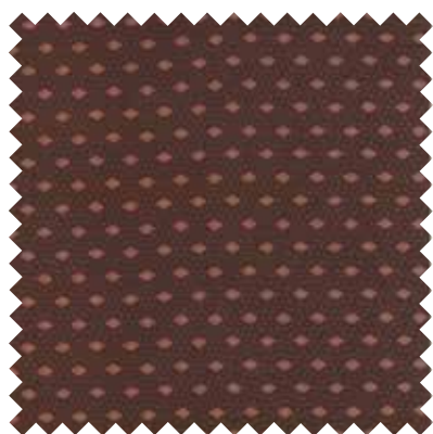
No 13655 16 Old Brown