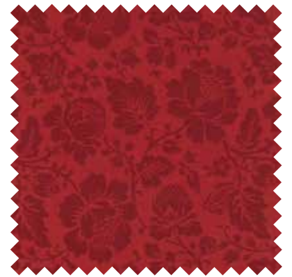
No 13654 16 Rouge