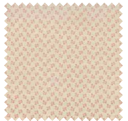
No 13659 36* Pearl