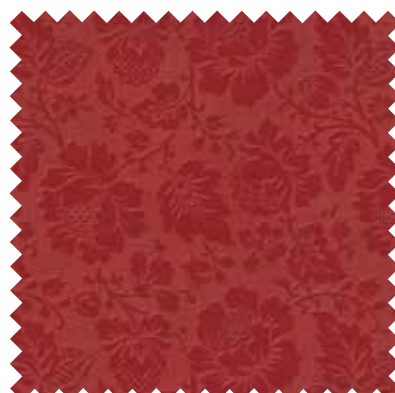
No 13654 13* Warm Red