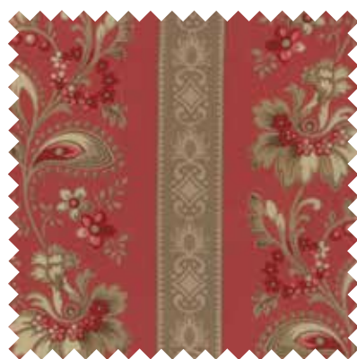
No 13651 11 Warm Red