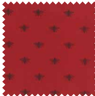
No 13656 12 Rouge