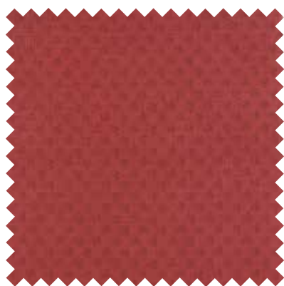
No 13659 30 Warm Rose