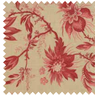
No 13652 19* Oyster Rouge