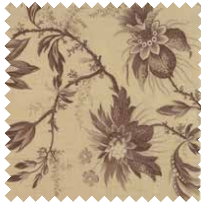
No 13652 20* Oyster Old Brown