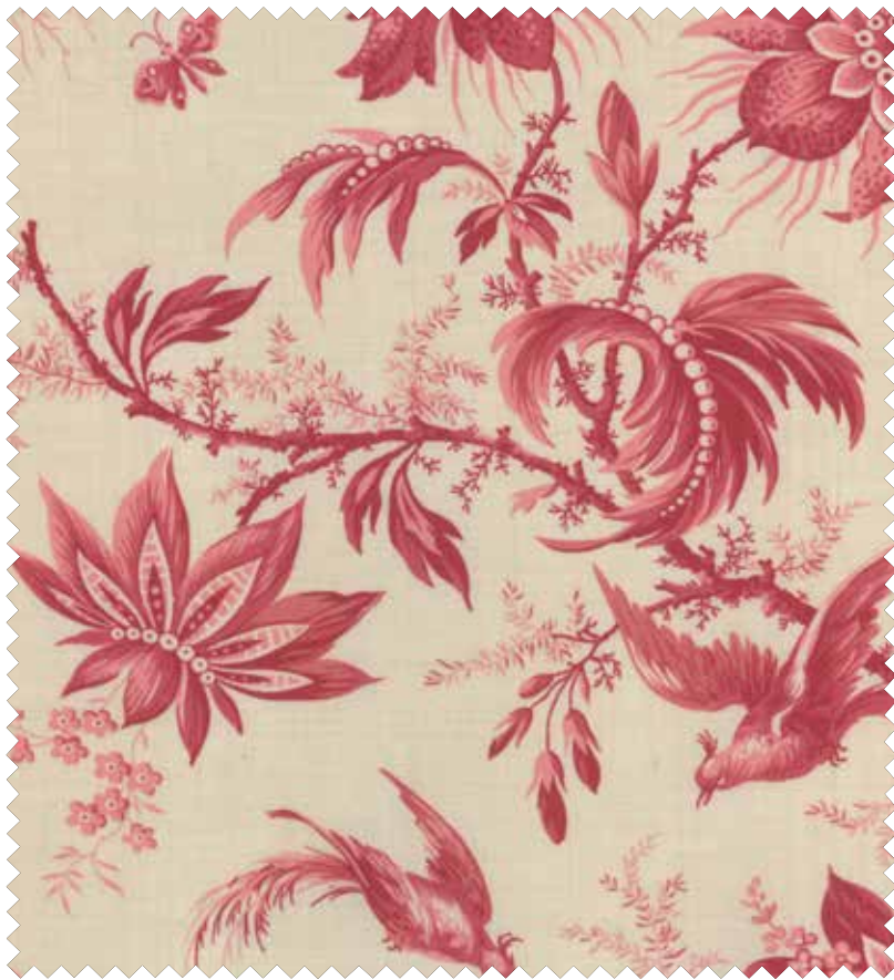
No 13652 17 Pearl