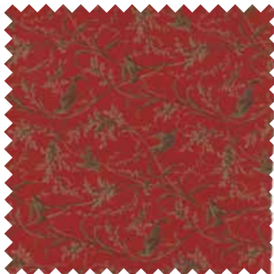
No 13657 14* Rouge