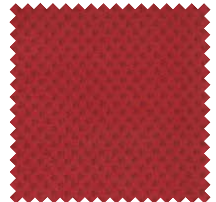
No 13659 32* Rouge