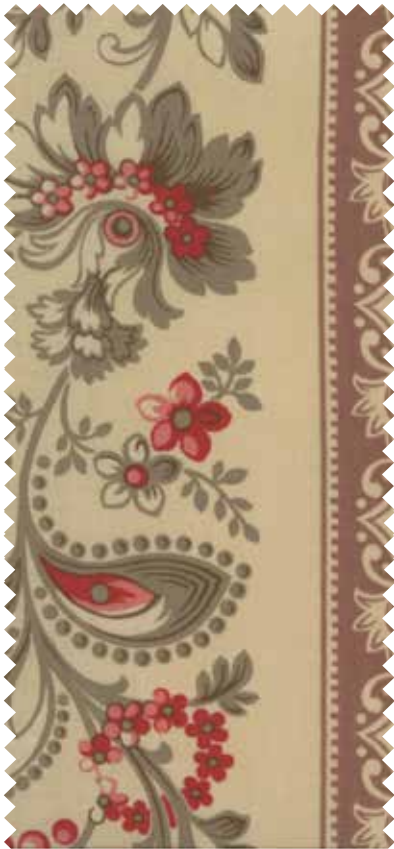
No 13651 17 Oyster