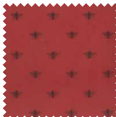
No 13656 11 Warm Red