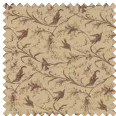
No 13657 20 Oyster