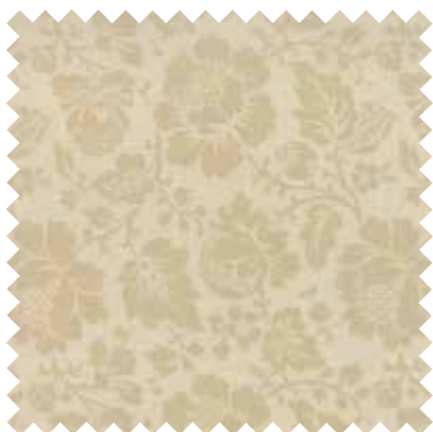
No 13654 20* Pearl