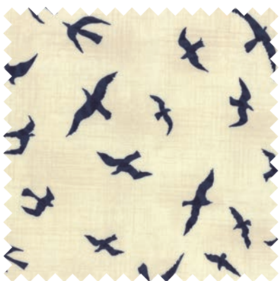
№ 1350 23* Pearl