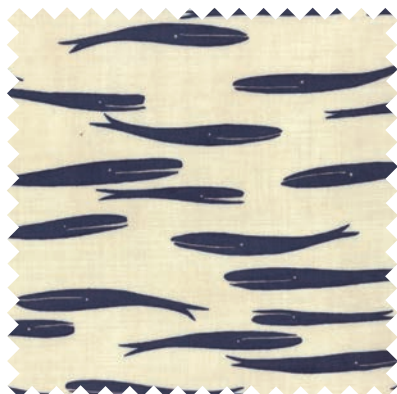
No 1355 21* Pearl