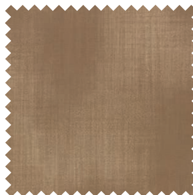
No 1357 15 Sand