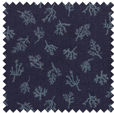
№ 1352 11 Ocean