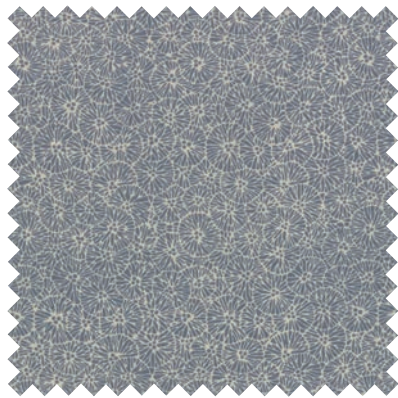
№ 1356 17 Sky