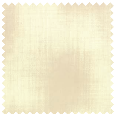
No 1357 17* Pearl