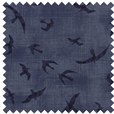
№ 1350 25 Tonal Ocean