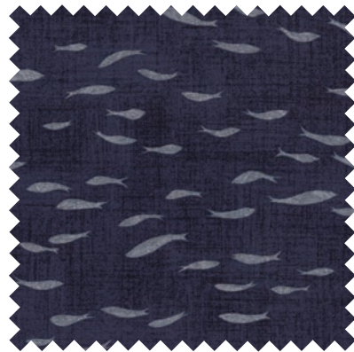
№ 1351 11* Ocean