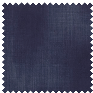
№ 1357 18* Ocean