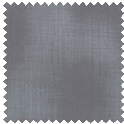
№ 1357 13 Sky