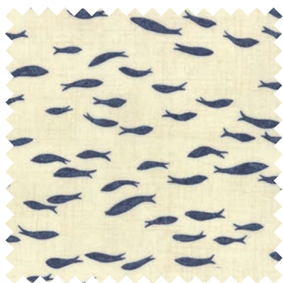
№ 1351 20* Pearl