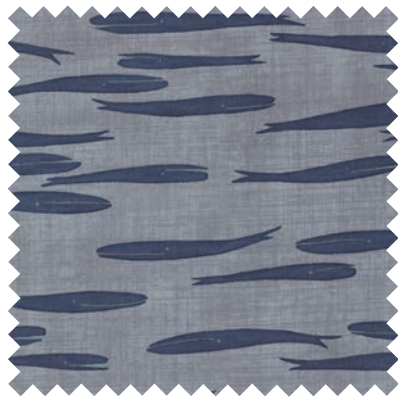
№ 1355 14* Sky