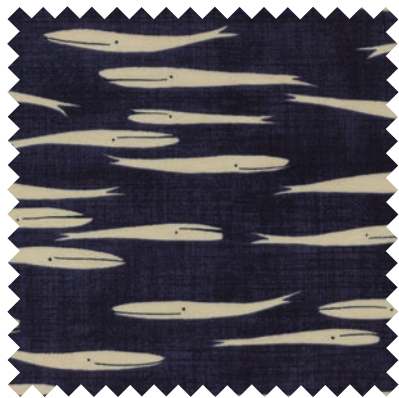
№ 1355 12* Ocean