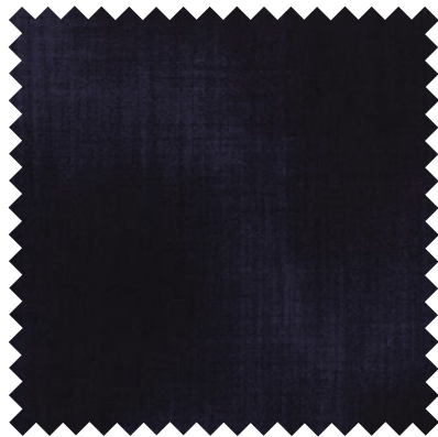
№ 1357 11 Dark Ocean