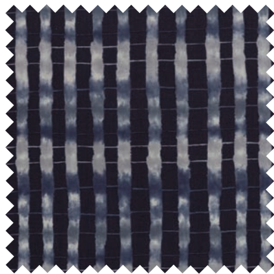
№ 1353 11 Ocean