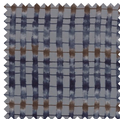
No 1353 15* Sky