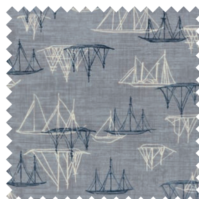
No 1354 14 Sky