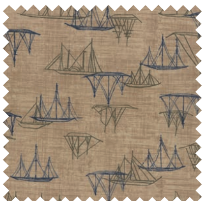
No 1354 16* Sand