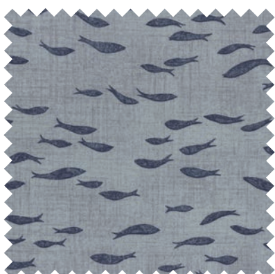
No 1351 13 Sky