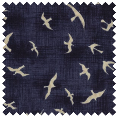
№ 1350 12* Ocean