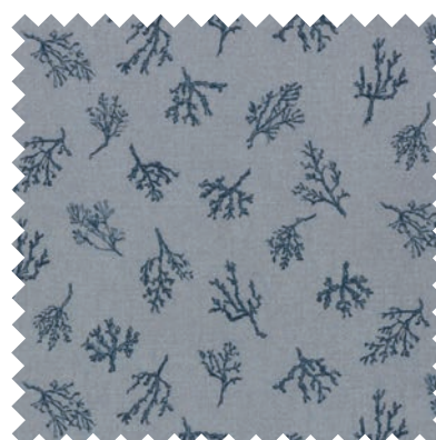
No 1352 13* Sky