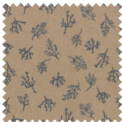
No 1352 17 Sand