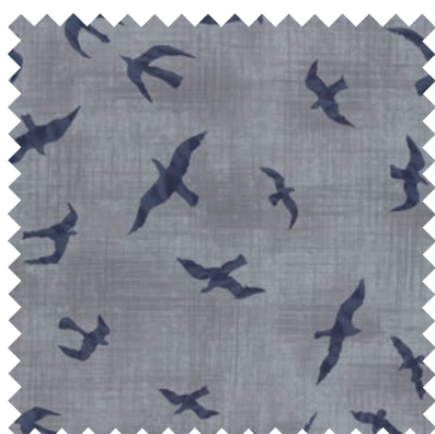
No 1350 16* Sky