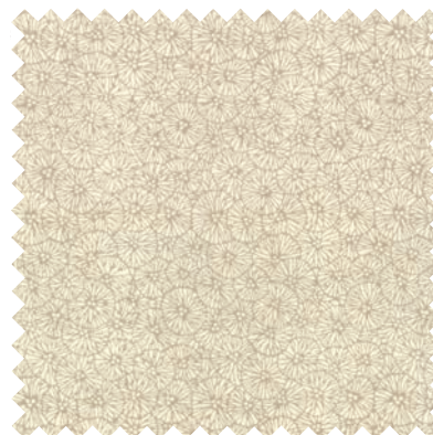
No 1356 27* Pearl