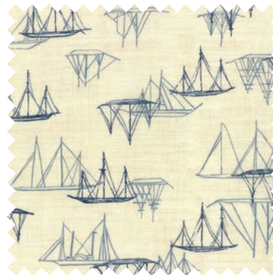
No 1354 20* Pearl