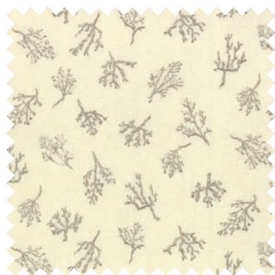
№ 1352 22* Pearl