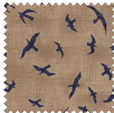
No 1350 19* Sand