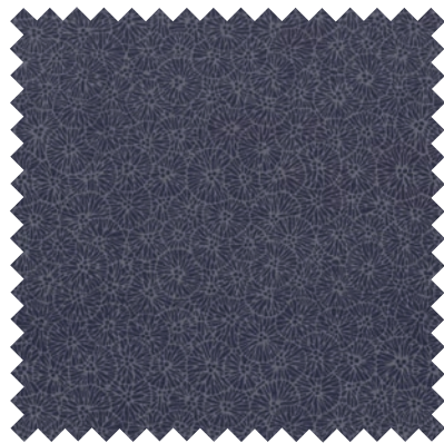
№ 1356 15* Ocean