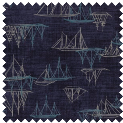
№ 1354 11* Ocean