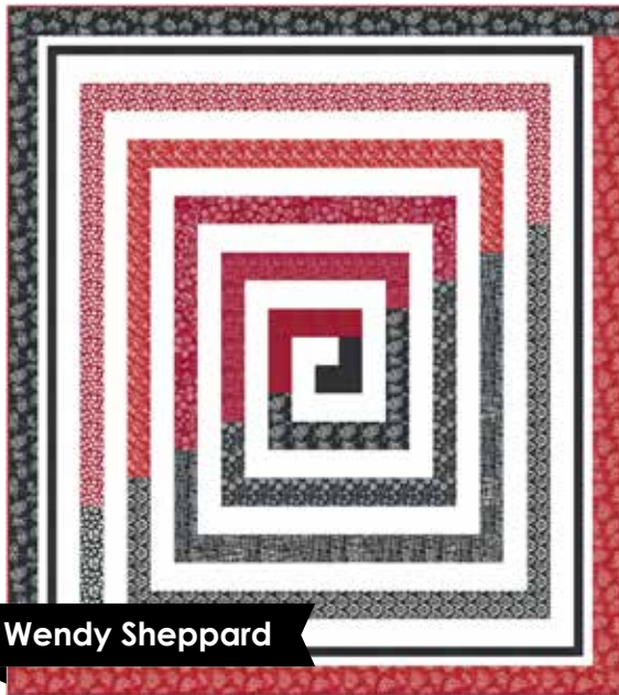
WS 43 Labyrinth 65" x 73"

Throughout history, the combination of Red, White and Black has had significance in folk art and mythology. Using prints and motifs taken from nature, this collection of batiks are colored Fire, Ice and Coal to symbolize elements in our natural world.