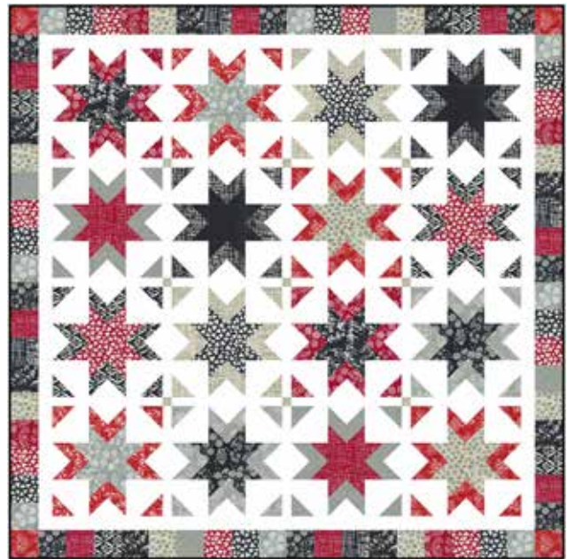
WS 30 Sparklers 60" x 60"