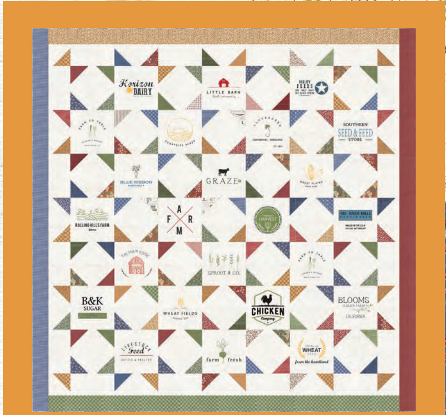
SW P301 Farm Fresh 70" x 70" LC Friendly